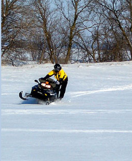
Time to play in a field.