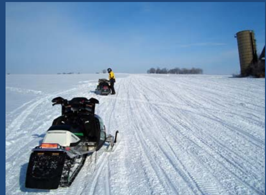
Heading north towards Burlington on trail 1.

Grand Pines Resort 9993N Grand Pines Lane. Hayward, WI 54843 (888) 774-3023 www.grandpines.com